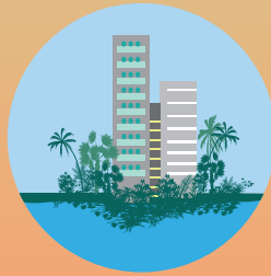
Don't build over