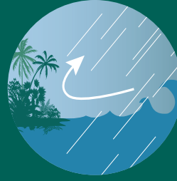
Reduce storm surges and protect coastlines